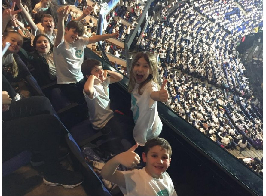
Some of our choir at the O2!