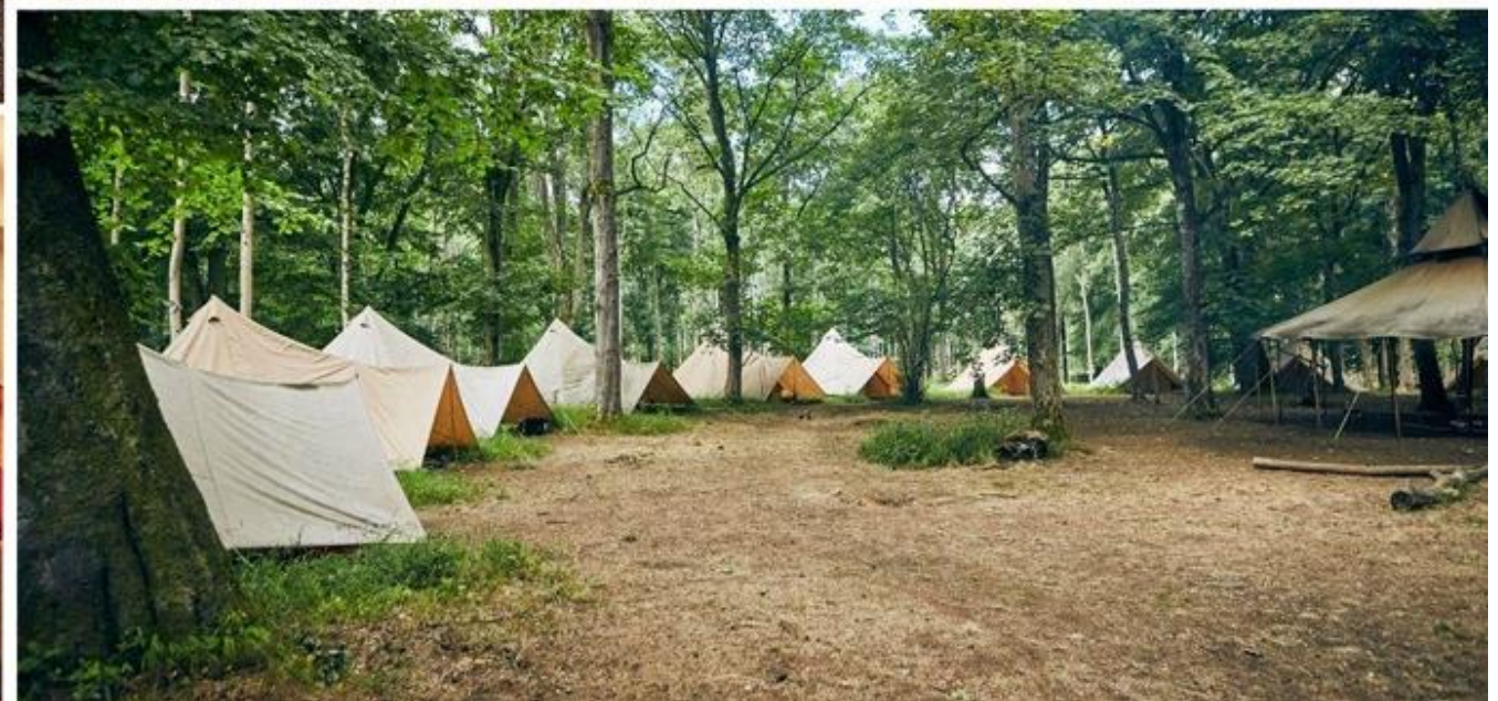
X3 boys tents x2 girls tents